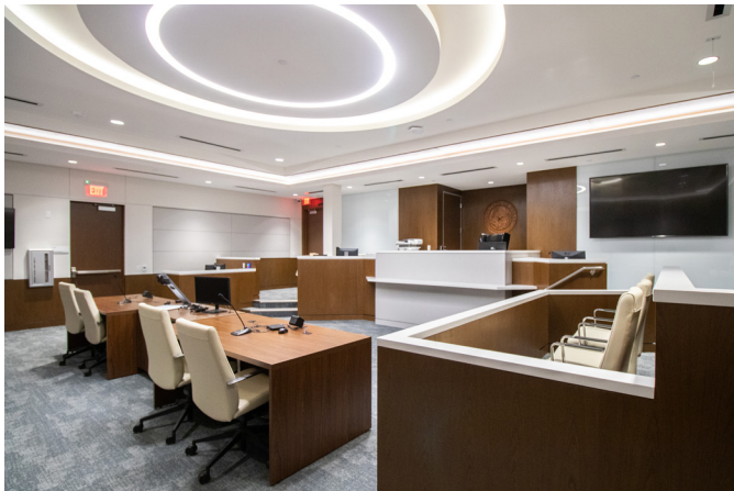
City of Frisco - Municipal Court